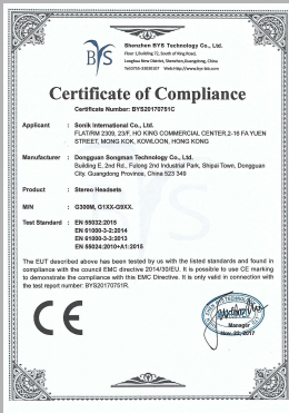
Gaming Headsets CE