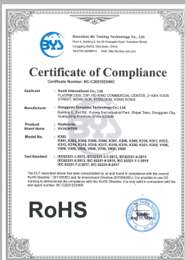
Gaming Keyboards ROHS