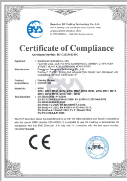
Gaming Mouses CE