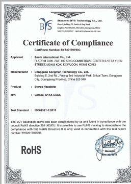
Gaming Headsets ROHS