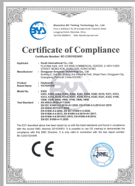
Gaming Keyboards CE