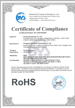
Gaming Mouses ROHS