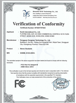
Gaming Headsets FCC